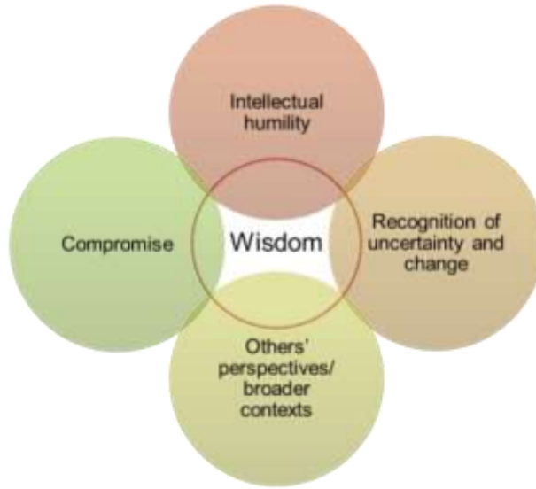
Figure 1. Illustration of several commonly-used wisdom-related cognitions in the modern psychological wisdom scholarship. For further details, see Grossmann et al. (2010, 2013)